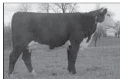
Lot 28 – Right to Flush – Sired by P606