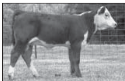
Lot 10A – Sired by Remitall Patriot 13P