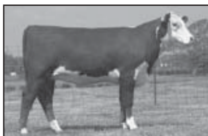
Lot 25A – Sired by Remitall Patriot 13P