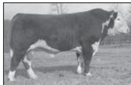
Lot 27 – Mohican Panama P90