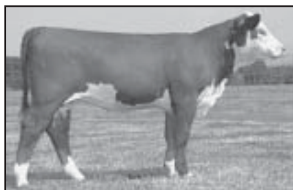
Lot 32A – Sired by Remitall Patriot 13P