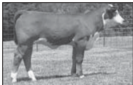
Lot 13A – Sired by Git-R-Done