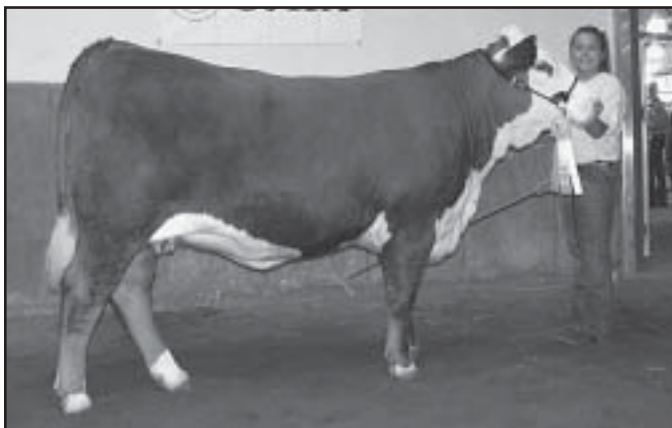
Division III Reserve Champion – GHF Lady Dimension 23M R103 owned and shown by Kari Dylong.