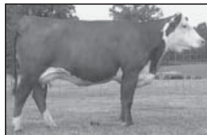
Lot 10 – Sired by Remitall Boomer 46B