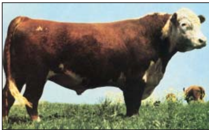
RWJ Victor J3 212