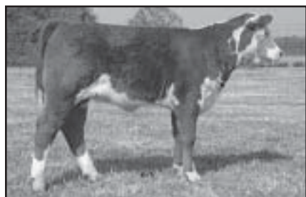
Lot 63A – Sired by Mohican Eureka 67J