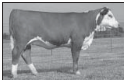
Lot 18A – Sired by Mohican Eureka 67J